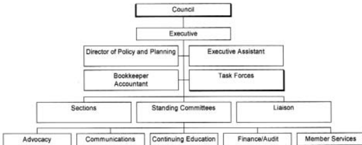
Ontario Psychiatric Association Organizational Chart

Date approved: November, 2000 Date for next review: September, 2004